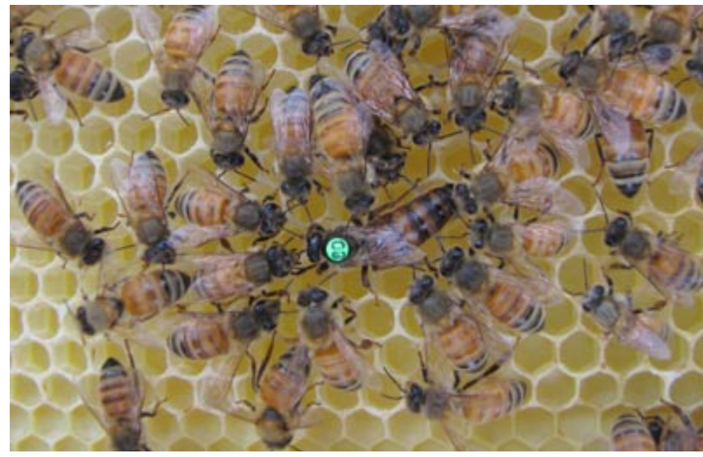
Worker honey bees perform a "retinue response," in which they are attracted to the queen (marked with a number tag), surround her, lick her, and "smell" her with their antennae. This behavior allows the workers to pick up the queen pheromone and spread it throughout the colony. The queen pheromone provides "honest" information to the workers about her presence, mating status, and mating quality.

"We usually think of animals' chemical signals (called pheromones) as communication systems that convey only very